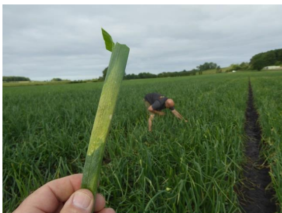
Grey mould in onions from sets the 21st of June

Unfortunately we have already found grey mould ( Peronospora destructor ) in some onions from sets. Right now we hope that it will not spread to the seeded onions.